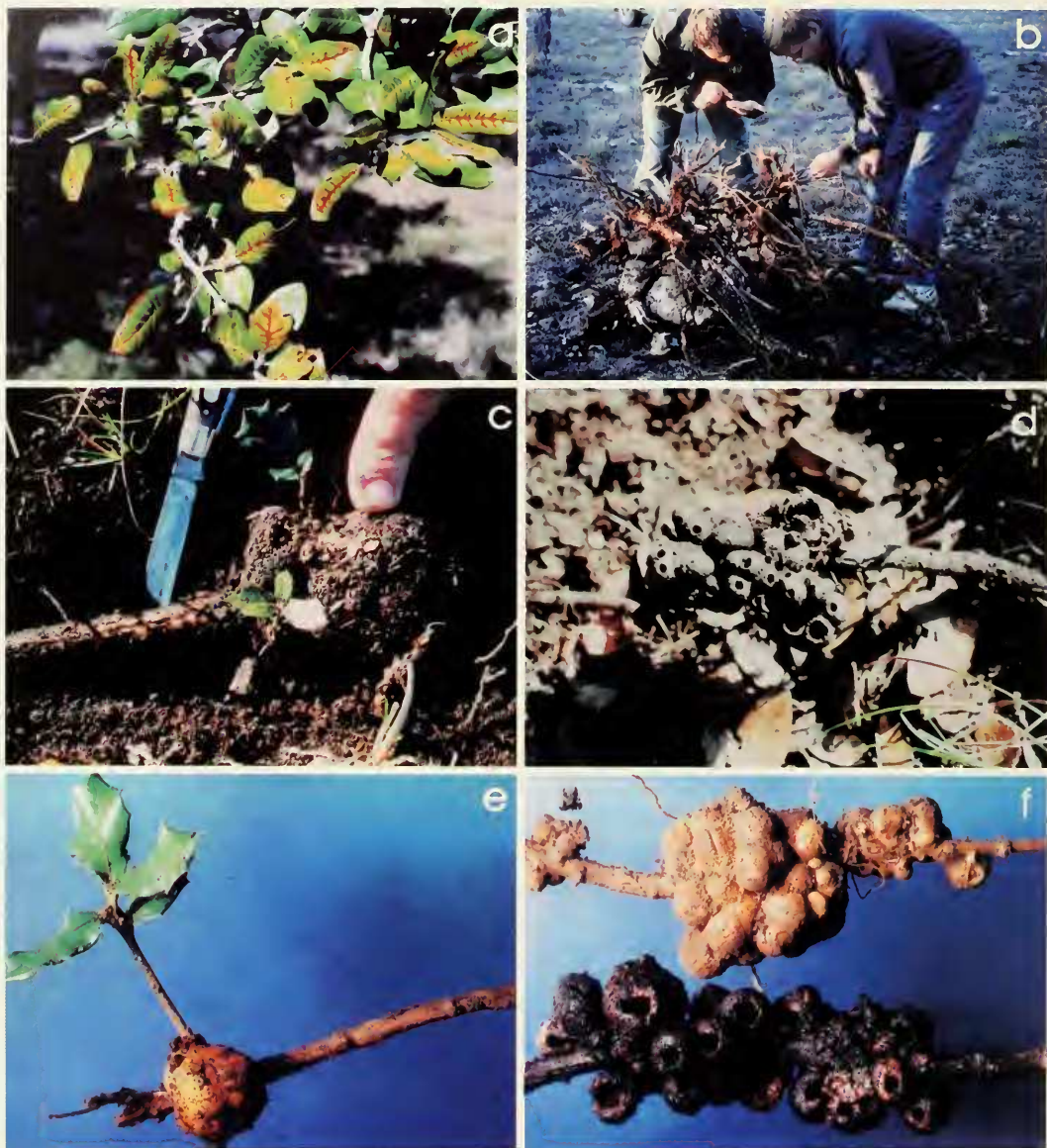
Fig. 1. Host-parasite relationships associated with O. nebulosa -induced galls collected from roots of live oaks. a, Veinal necrosis leaf symptom of oak wilt-infected tree. b, Location of galled root segments collected on feeder roots in the main root ball near the bole. c, Shallow subterranean root galls with root sprouts, collected before emergence. d, Multilocular (multichambered) gall with exit holes collected after emergence. e, Closeup of unilocular (single-chambered) gall with dead (pruned) distal root section and root sprout. f, Multilocular mature galls on root segments comparing the light-colored, current-year living galls (top segment) with black, necrotic previous-year galls (bottom segment).

surrounding the larva began aberrant cell division and expansion resulting in the formation of localized tissue swellings (Fig. 2a). Dark brown necrotic tissues with oxidized phenolic compounds (presumably lig-